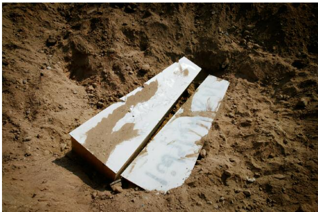
5 © CHRISTOPH BANGERT