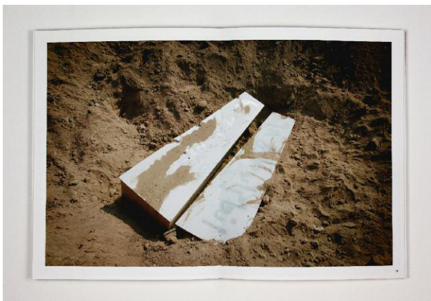
15 © CHRISTOPH BANGERT