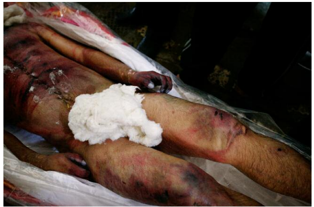
4 © CHRISTOPH BANGERT