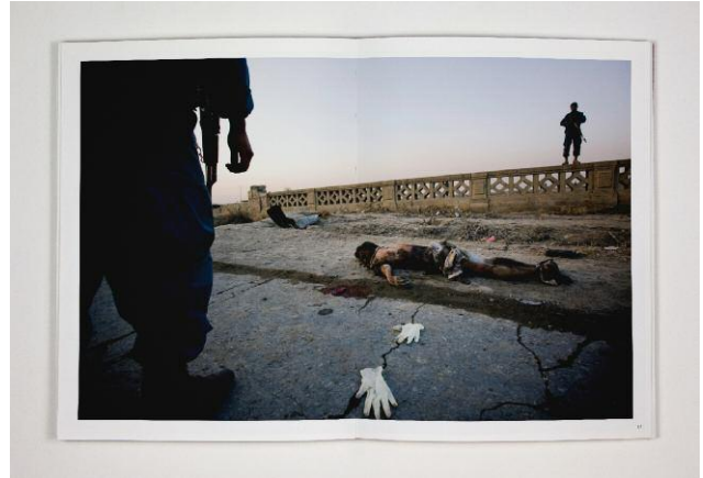
18 © CHRISTOPH BANGERT