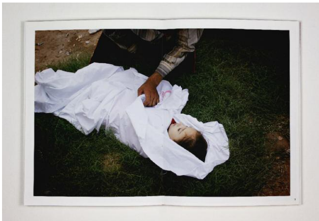
13 © CHRISTOPH BANGERT