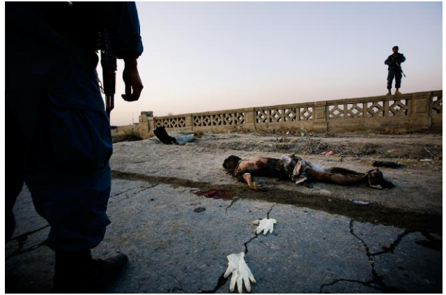
8 © CHRISTOPH BANGERT